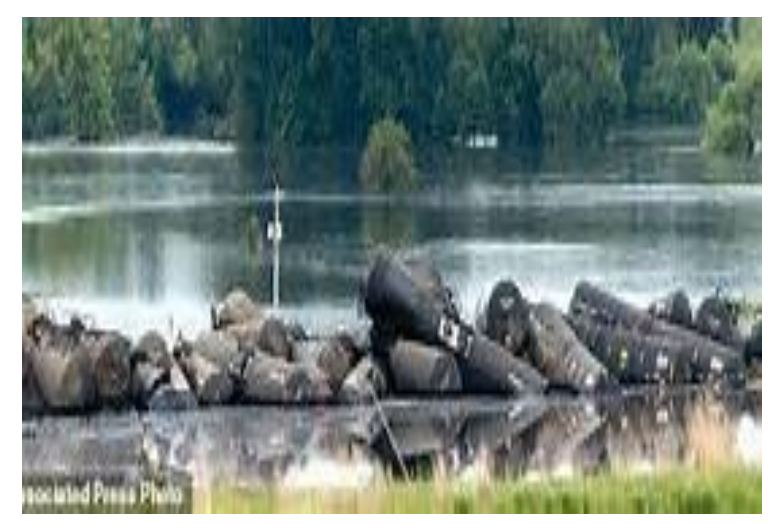
continued from page 1

ness and efficiency and optimize power distribution, train handling, brake control and fuel utilization," said CN.