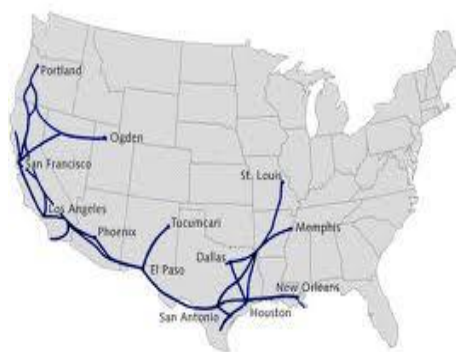
The Southern Pacific Railroad system

The Southern Pacific Transportation Company earlier Southern Pacific Railroad and Southern Pacific Company, and usually called the Southern Pacific or (from the railroad's initials) Espee, was an American Class I railroad. It was absorbed in 1988 by the company that controlled the Denver and Rio Grande Western Railroad and eight years later became part of the Union Pacific Railroad. The railroad was founded as a land holding company in 1865, later acquiring the Central Pacific Railroad by lease. By 1900 the Southern Pacific Company was a major railroad system incorporating many smaller companies, such as the Texas and New Orleans Railroad and Morgan's Louisiana and Texas Railroad.