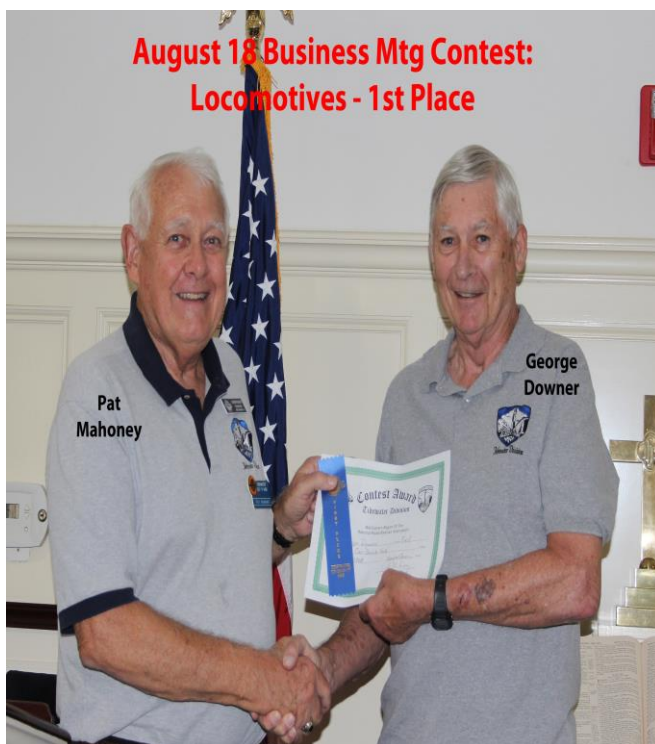
August 18 Business Mtg Contest: Locomotives - 1st Place