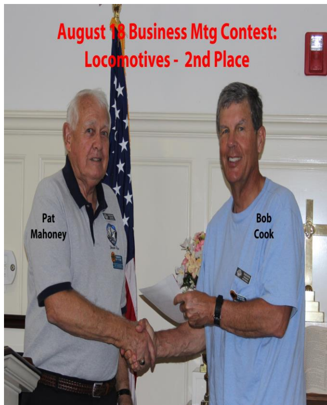
August 18 Business Mtg Contest: Locomotives - 2nd Place